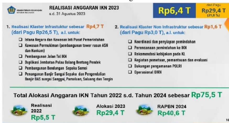
Picture 1. IKN Budget Realization

Source(s): Sri Mulyani, "APBN KITA EDISI SEPTEMBER 2023". 11